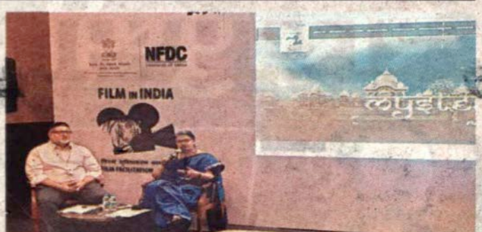
वर्कशाप के दौरान फिल्म निर्माता विचारों का अदान-प्रदान करते हुए।

फिल्मों के सफर का दायरा पिछले कुछ सालों में तेजी से बढ़ा है, छोटे गांव और शहर भी अब फिल्मों की शूटिंग के लिहाज से बड़े फिल्म डेस्टिनेशन के रूप में उभर रहे हैं। इस लिहाज से जरूरी है कि फिल्मों की शूटिंग के लिए प्रभावी सिंगल विंडो सिस्टम प्रणाली को सदढ किया जाए।