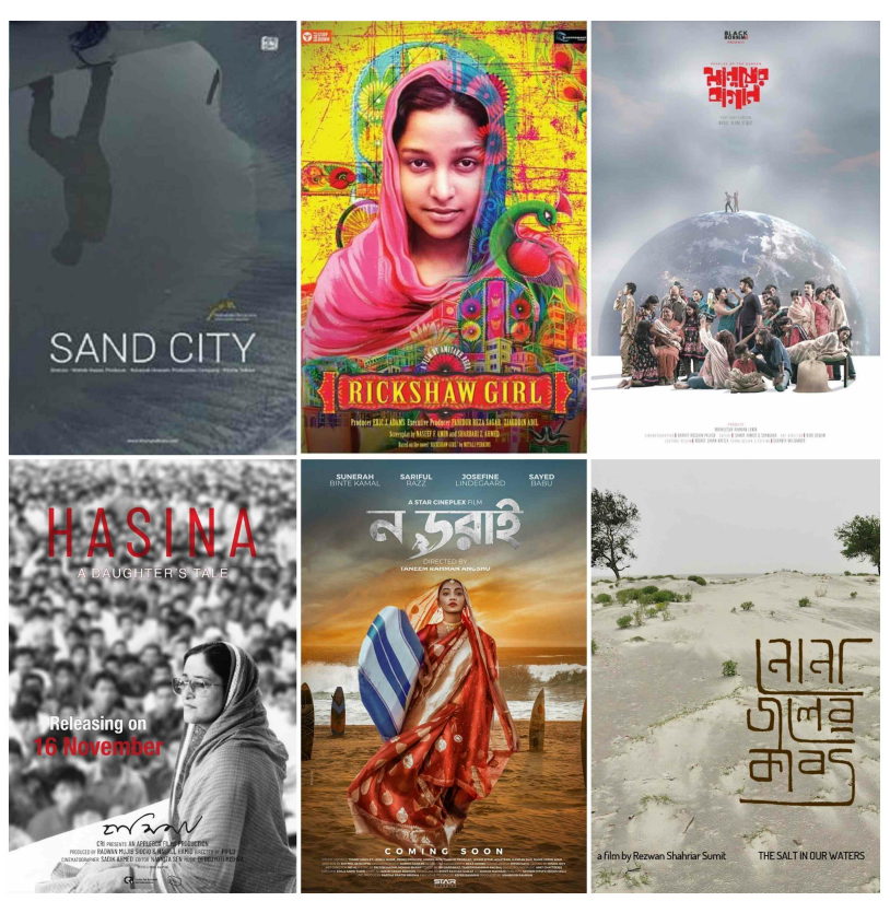
A total of nine Bangladeshi films were selected for Film Bazaar's Viewing Room 2019 segment, which features completed films. The segment includes Bangladeshi films Hasina: A Daughter's Tale by Piplu

A record breaking 11 Bangladeshi films are participating in the largest South Asian film market Film Bazaar, to be held at Goa in India this year. Bangladeshi film-makers have regularly participated with one or two films at this co-production market organized by the National Film Development Corporation (NFDC), but this is the first time they are making waves on the shores of Goa.