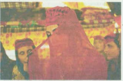
Lalla Aur Satt Geet