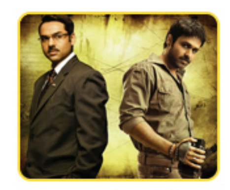
Shanghai (Criticaly Acclaimed)

The sixth edition of Film Bazaar Coproduction Market will take place 21 - 24, November 2012 in Goa, concurrent to the International Film Festival of India (IFFI).