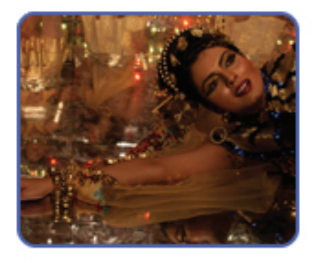
Miss Lovely (Un Certain Regard, Cannes 2012)

25 projects in need of additional financing and artistic support are showcased in the Co-production Market every year.